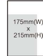
Junior Page 小全版