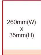
Front Cover Bottom Banner 封面底橫條