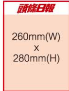
Front Cover 封面