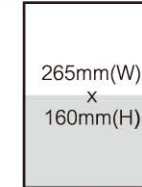
Horizontal Half Page 橫半版