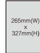
Full Page 全版