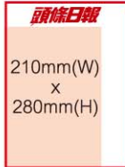
Mini Front Cover 迷你封面