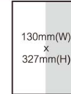
Vertical Half Page 直半版